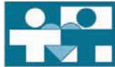
Hamilton County Board of MR/DD